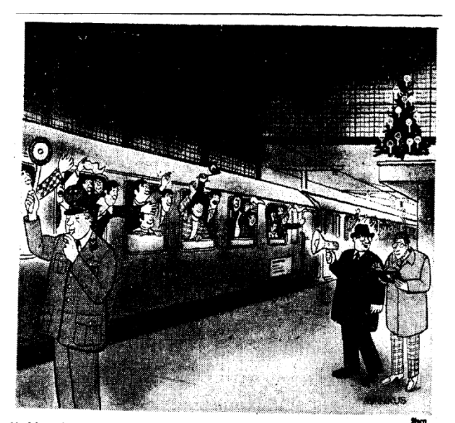
'And how do you say, 'Have a pleasant Christmas vacation, you're all fired,' in Turkish?" Figure 3: A cartoon printed in The New York Times, January 27, 1974 (see Whitney 1974).

Solutions were discussed – for example, moving production to Southeastern Europe, following the example set by the United States and Mexico – and quickly dismissed for fear of growing unemployment once production had been outsourced.<sup>30</sup> Morris continued to follow events in Germany and published several articles in 1973-1974 on the dire social conditions many labor migrants had to endure in Germany: the "slums" and "ghettos" in Berlin, and the halt called to recruitment and its consequences. He repeatedly used the German expression "gastarbeiter" in his texts, mainly in the context of labor migrants from Turkey (Morris 1973a, 1973b).